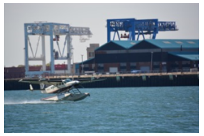
Never race a seaplane