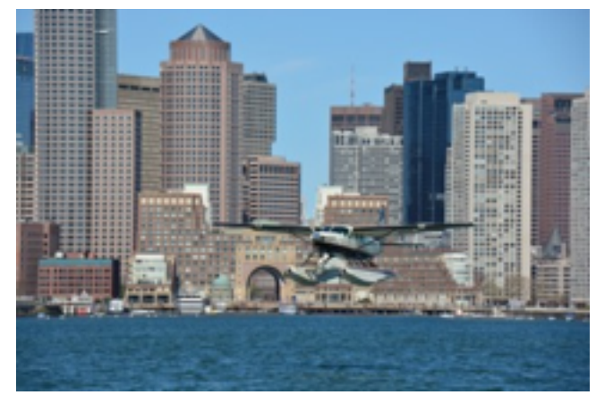
Hold your course and speed Always monitor VHF CH 13